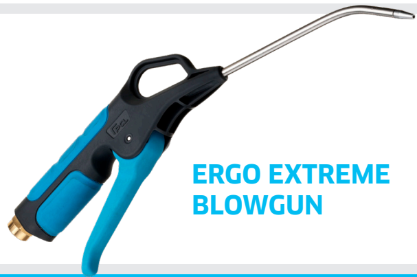
ERGO EXTREME BLOWGUN